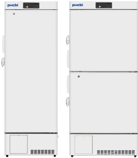
MDF-MU339HL-PE | MDF-MU539HL-PE